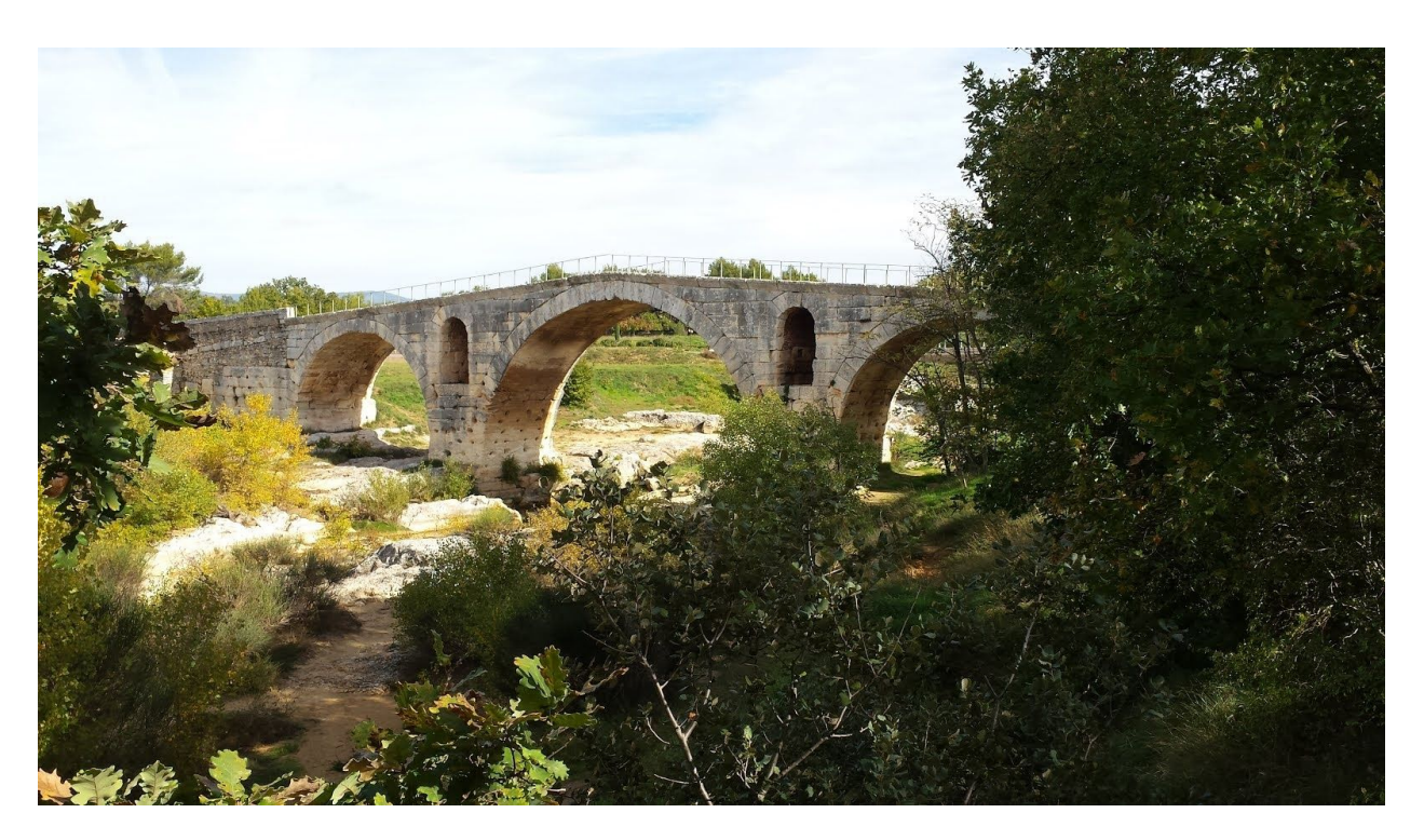
Pont Julien - Roman bridge from the 1st century-another photo op on your tour

These choices allow flexibility in the event of rain as one tour visits primarily indoor venues in the region. This is a sample 3 or 4 day itinerary and is quite easy to modify to suit your interests or account for inclimate weather. Every group we have shepherded through Provence has opted to spend at least an afternoon in our home base of L'Isle sur la Sorgue. It is a great town in which to relax, shop or find a corner table from which to people watch.