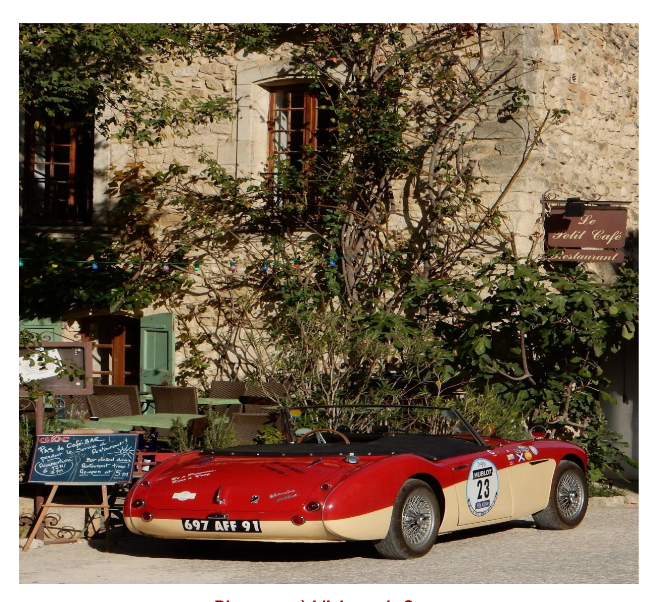
Bienvenue à L'Isle sur la Sorgue