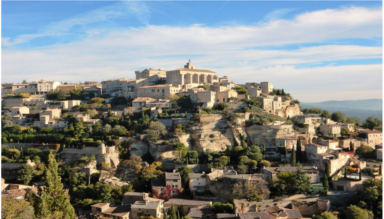
The village of Gordes - you will be in this very photo on your visit

Here are ideas and suggested itinerary for your visit to the Vaucluse, the Luberon and beyond. You may wish to make changes due to weather, the misfortunes of travel, or because you have other interests. We have proposed some ideas for what has worked for guests planning a short trip to the region. There are many options for add-ons should your travel schedules allow for a lengthier stay in the Vaucluse.