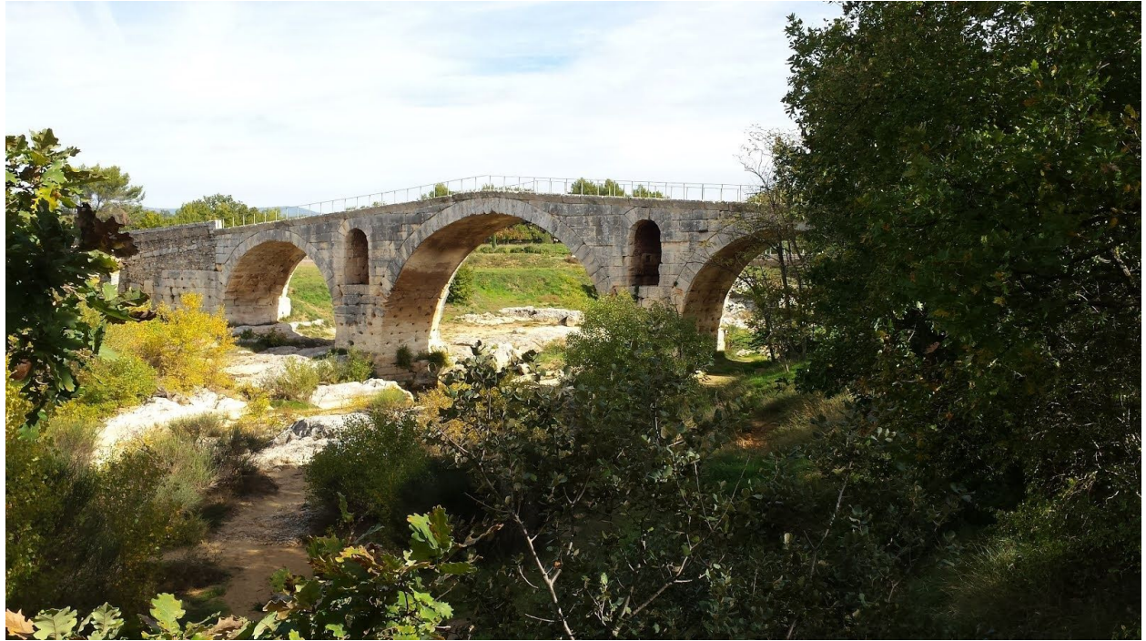
Pont Julien - Roman bridge from the 1st century-another photo op on your tour

These choices allow flexibility in the event of rain as one tour visits primarily indoor venues in the region. This is a sample 3 or 4 day itinerary and is quite easy to modify to suit your interests or account for inclement weather. Every group we have shepherded through Provence has opted to spend at least an afternoon in our home base of L'Isle sur la Sorgue. It is a great town in which to relax, shop or find a corner table from which to people watch.